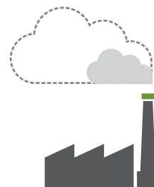
REDUCE THEIR EMISSIONS

In an ETS, the government sets a clear emissions target, capping the maximum amount of emissions that are allowed in selected sectors of the economy. This ensures that the desired environmental outcome will be reached. With a steadily declining cap, an ETS also delivers a predictable reduction pathway, which sends a long-term signal for businesses and investments.